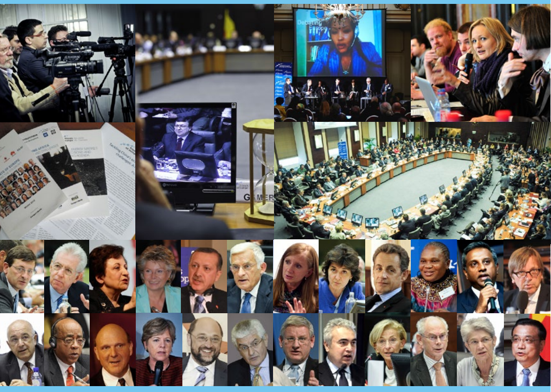
Some of the familiar faces and household names who have used Friends of Europe's high-profile yet neutral platform to put across their ideas to decision makers and to public opinion

Future Europe | Smarter Europe | Greener Europe Quality Europe Global Europe Security Europe